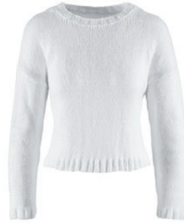
WANDER WOMAN • HAPPINESS 65% cotton (pima), 35% nylon