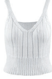
BLISSED OUT • SUNSHINE 100% organic cotton (mercerized)