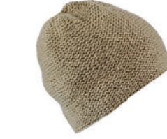
RAZZLE-DAZZLE • HAPPINESS 65% cotton (pima), 35% nylon