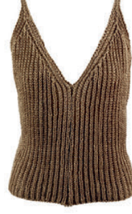
CHEEKY CRAFTER • SUNSHINE 100% organic cotton (mercerized)