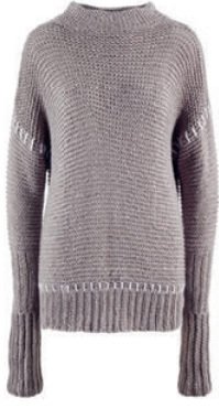
ENDLESS DRIFTER • HAPPINESS 65% cotton (pima), 35% nylon