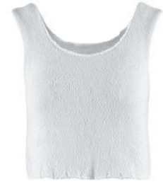
WHITTY WHIRLWIND • SUNSHINE 100% organic cotton (mercerized)