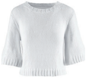
SLOW STARGAZER • HAPPINESS 65% cotton (pima), 35% nylon