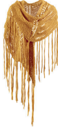
LIKE SUNBEAMS • SUNSHINE 100% organic cotton (mercerized)