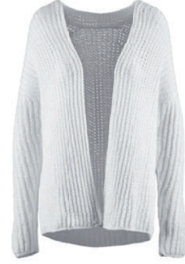
SOLID STONE • HAPPINESS 65% cotton (pima), 35% nylon