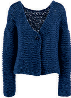
HAPPY SOUL • SUNSHINE 100% organic cotton (mercerized)