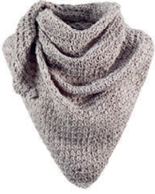
GOOD MOOD • HAPPINESS 65% cotton (pima), 35% nylon