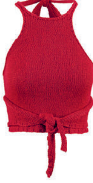
RADICAL ROMANCER • SUNSHINE 100% organic cotton (mercerized)