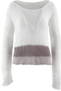
STRONG SPIRIT • SUNSHINE 100% organic cotton (mercerized)