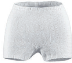
SUNNY-SIDE UP • SUNSHINE 100% organic cotton (mercerized)