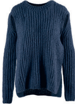
LET'S REBEL • HAPPINESS 65% cotton (pima), 35% nylon