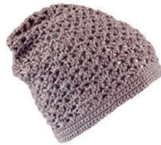
COBBLESTONE • SUNSHINE 100% organic cotton (mercerized)