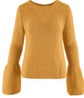
SPRING FAV • SUNSHINE 100% organic cotton (mercerized)