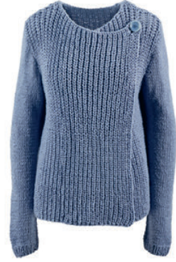
OUTDREAM YOURSELF • HAPPINESS 65% cotton (pima), 35% nylon