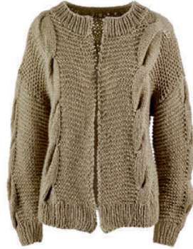
SWEET DESIRES • HAPPINESS 65% cotton (pima), 35% nylon