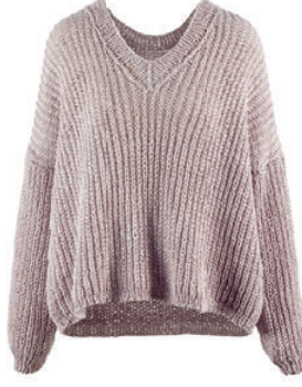
FOOL'S PARADISE • SUNSHINE 100% organic cotton (mercerized)