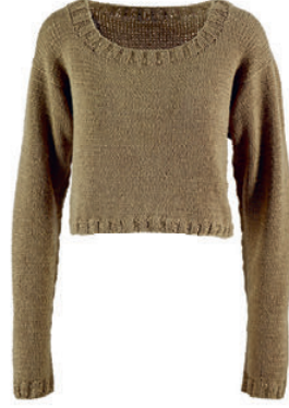
GLOW-GETTER • SUNSHINE 100% organic cotton (mercerized)