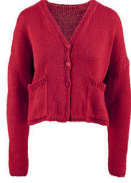
PASSION FUELED • SUNSHINE 100% organic cotton (mercerized)