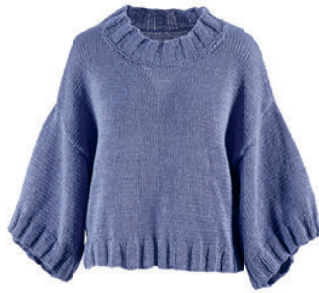
GAME CHANGER • SUNSHINE 100% organic cotton (mercerized)