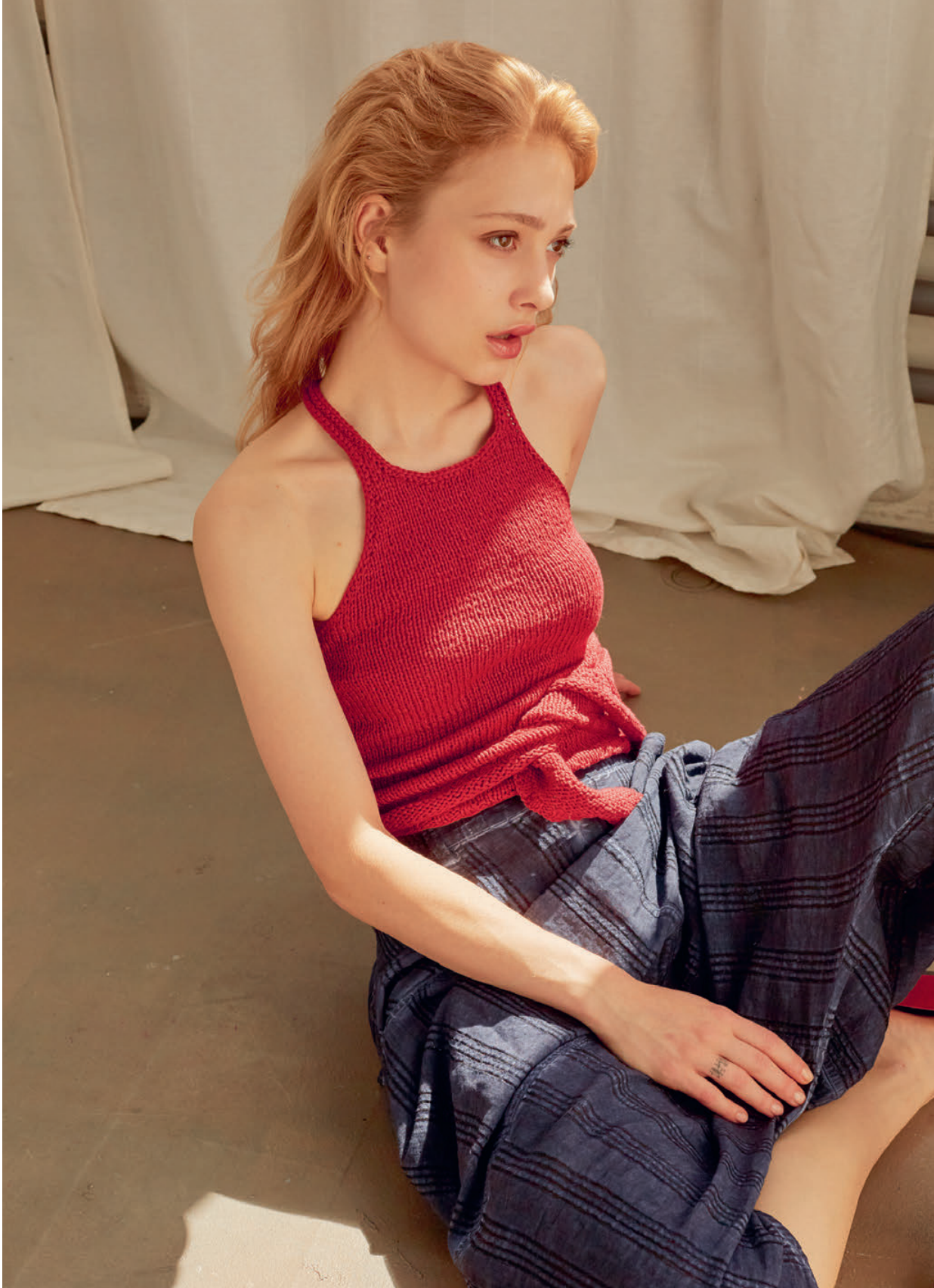
SUNSHINE THIS OUTFIT SAYS IT ALL: "BE KIND, NOT NICE!" NOT A TYPICAL DAYDREAMER LOOK: IT'S ONLY FOR EMPOWERED WOMEN. RADICAL ROMANCER TOP PATTERN# 260-013-001